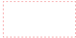
BARREL PRINT AREA 40x20mm