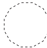
20 mm dia